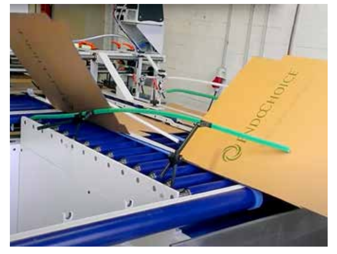
Straight line finishing

Straight line: carton board to BC double wall Crash lock: carton board to EB double wall Carton