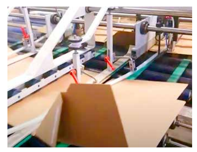
Crash lock finishing