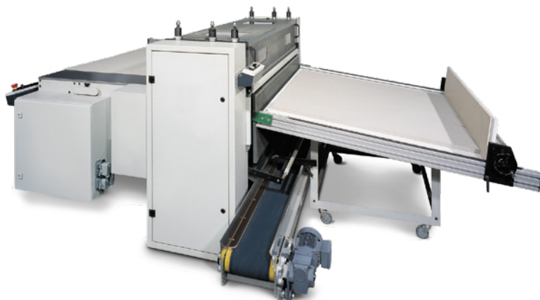
Rotary board cutter PK 170 with inclined deposit table