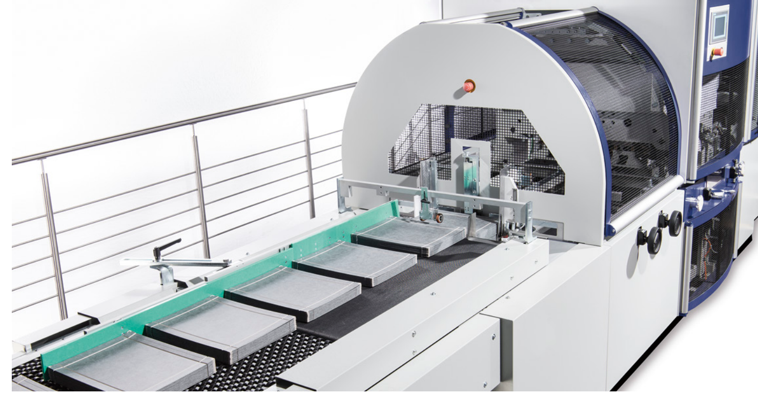
Infeed CF 500 of cross grooved boards in Box Line Puncher