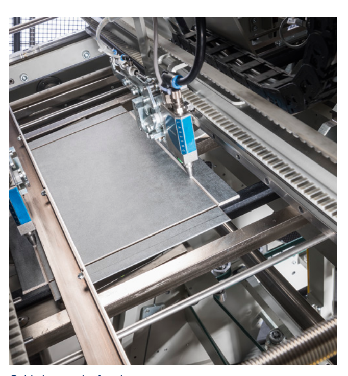
Cold glue nozzles for gluing grooves