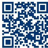
YouTube Video DA 370 digital